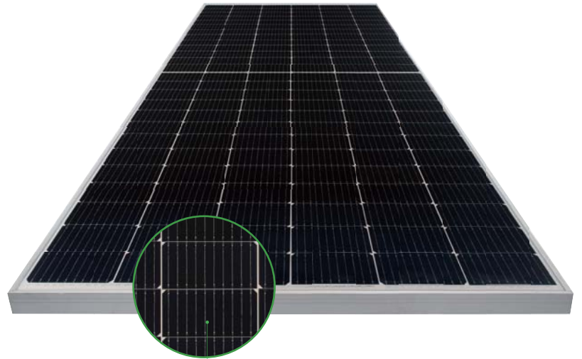
MBB HC Technology

Occupational health and safety management systems